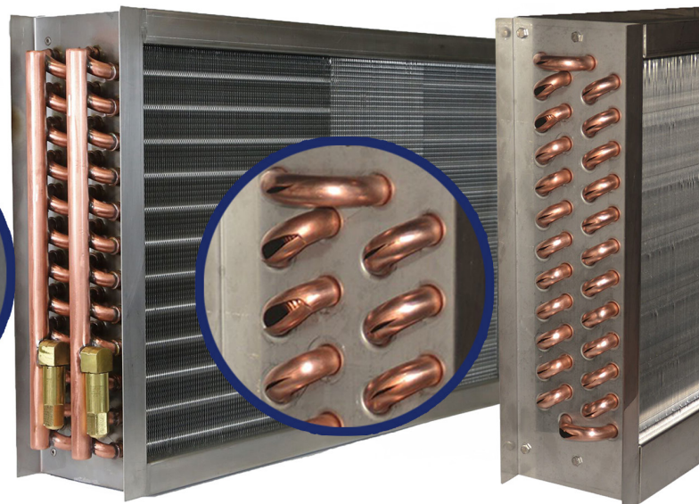
UNPROTECTED COIL RETURN BENDS SPLIT